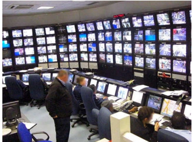
Figure 1: CCTV control room, site UK3

Copyright 2010 ACM 978-1-60558-929-9/10/04...$10.00.