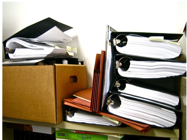
Figure 4: Binders of line sheets for a wiretap case at site US2. Note the post-its attached to items of interest within the binders, used for marking evidence that could be used at grand jury or trial.

US1 were not alone in their need for officers to be diligent about providing information to make recorded video useful. US2-1, a detective, related a cautionary story wherein a fellow officer had recorded several days of video in a surveillance operation. During the course of the operation, a car of interest drove through the frame of the camera. However, the officer forgot to mark the date and time at