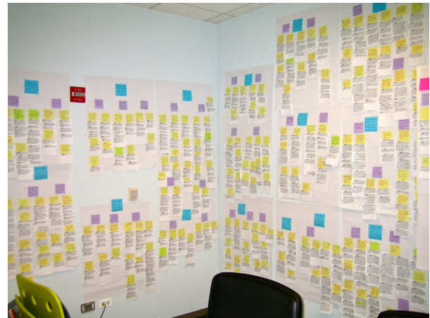
Figure 2: A portion of the affinity diagram used in our analysis

Participants were recruited from many different roles, including eleven CCTV video operators, five full-time police officers, one records clerk, two property and evidence technicians, and four prosecuting attorneys. We performed a contextual inquiry [3] employing several qualitative methods for data collection, including semi-